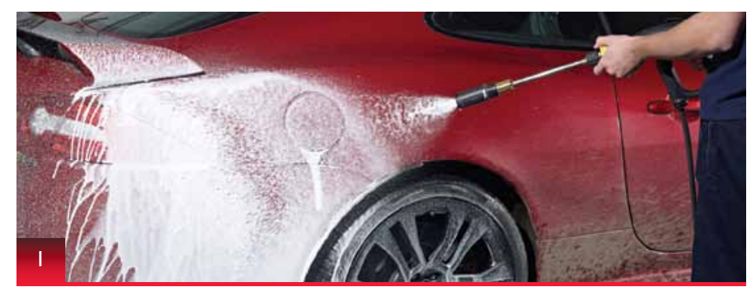
Fill the detergent reservoir of the pressure washer with Autoglym Pressure Wash . Cover the entire vehicle with foam.

Clean your car quickly and easily by using a high-pressure power hose to effectively remove the build-up of mud and road grime.