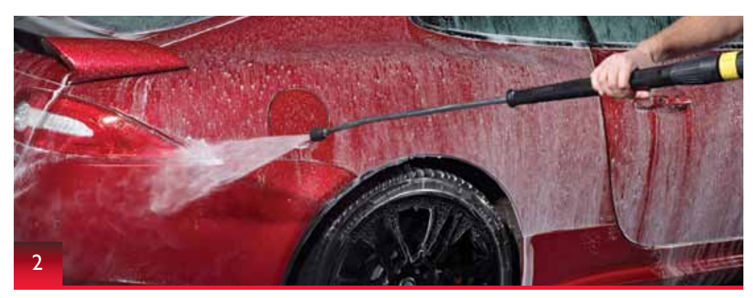
When rinsing, start at the bottom and work up. This helps to flow off the dirt and stops Pressure Wash streaking down the side of the car. It also leaves the detergent in place until the last minute.