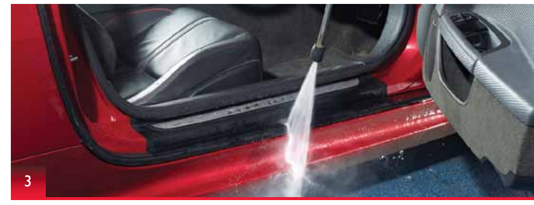
When cleaning door shuts, start the hose away from the vehicle then move the jet onto the area to be rinsed. This gives more directional control as the recoil from a power hose is considerable.