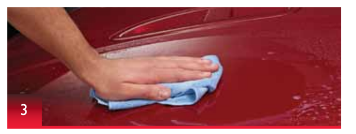
Use one of the supplied microfibre cloths to spread the wax, then the other one to buff to a high gloss.