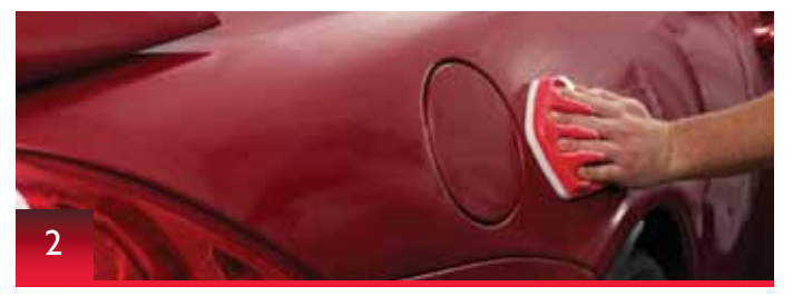
Use a light pressure to apply liquid to the car and leave to dry thoroughly for one to two hours to allow resins to cure.

Pour Extra Gloss Protection onto the Perfect Palm Applicator . Do not pour liquid onto the car.