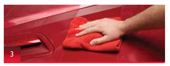
Buff to a high gloss with the red finishing cloth supplied, turning it frequently to avoid build-up.